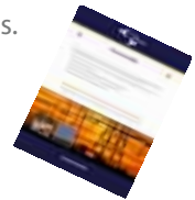
The Certus Way brochure

Certus Strategies provides a fully integrated approach to engaging and consulting stakeholders. This assists energy projects achieve not just compliant, but effective engagement, consultation and resolution to stakeholder issues and concerns. The Certus Way also provides experienced guidance in managing regulatory requirements and relationships in Canada and the United States.